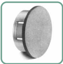
PRY OUT PLUGS